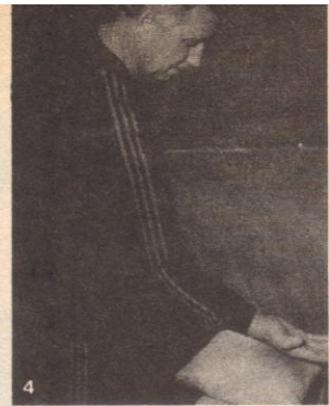
4 The second stage in striking the bag employs the back of the hand. Care should be exercised to avoid hard contact on the wrist and fingers.