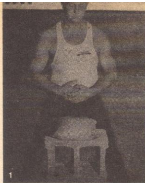
1 This is the position used for the five-minute meditation prior to striking. The focus of concentration is on the tan tien and palms.