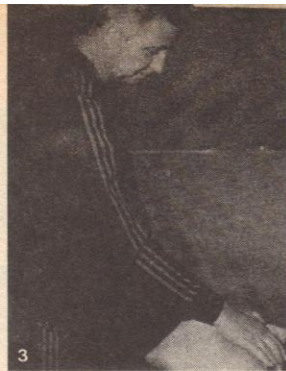
3 This is the finishing position for the first striking method using the palm. Subsequent striking surfaces are the back of the hand, knife edge, palm heel, and finger tips.