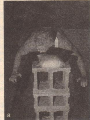
8 This is the second stage of the breathing exercise. Breathing is only diaphragmatic and the exhale should be long and even as the palms descend.

types of herbs in the formula, some rare and difficult to obtain, compiled in certain relationships and blended with a high-proof rice whiskey or vodka in special proportion. Allowed to ferment or "cook" for a stipulated period, it produces a powerful liquid which can have incredible impact on the internal power of the body. Therefore, it is quite expensive.