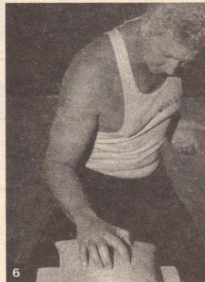
6 Fingertip striking is not recommended until you have trained the hand for at least six months. The additional joints restrict chi flow to a greater extent than the shoulder, elbow and wrist.