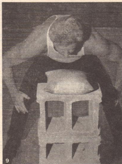
9 Prior to the final meditation process, Chicoine rubs his knees vigorously with his palms for one minute to create additional heat. This facilitates the absorption of the vital herbs.

Also, one must be taught the many methods used in striking the hand: how many times to strike each way, how many strikes to make at the beginning of training and what progression should be followed, the benefits and drawbacks of training just one hand as opposed to both, and the best way to generate maximum power. It is far more involved than people realize. There are other technical considerations: how to properly construct your bag, what type and