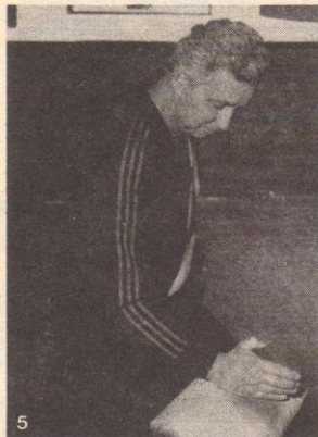
5 The knife-hand strike. As with all methods, tension on the hand is only induced prior to impact to keep chi flowing through the arm.