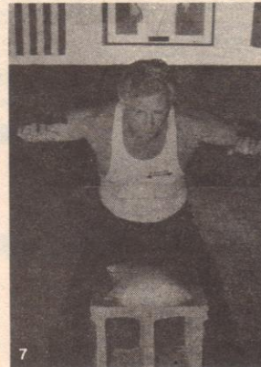
7 This is the first stage of the breathing exercise done immediately after the striking sequence. As the practitioner bends over, tension is maintained on the palms as they are pushed toward the floor.